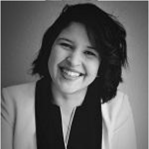
Salem/Keizer School District Board