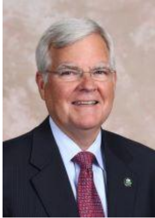
Marion County Commissioner