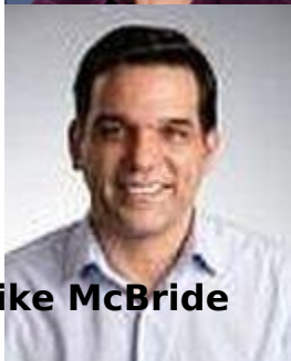
McMinnville City Councilor