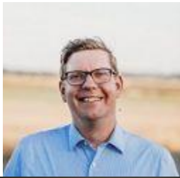
Polk County Commissioner