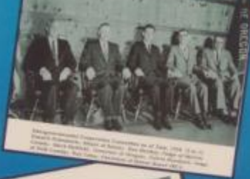
Intergovernmental Cooperation Conference of July 1959. (L to R) Mayor, Marion County, Oregon; Mayor, Polk County, Oregon; Mayor, City of Salem; Mayor, Metropolitan School District 24CJ; Mayor, Marion County, Oregon; Mayor, Polk County, Oregon; Mayor, City of Salem; Mayor, Metropolitan School District 24CJ.

1957 with the establishment of the Mid-Willamette Valley Planning Council. It was an organization created to provide planning services to Marion and Polk Counties, the City of Salem, and Metropolitan School District 24CJ. In 1959, a 200-person Citizens Conference for Governmental Cooperation made recommendations that included the establishment of the Compact of Voluntary Intergovernmental Cooperation. It included representatives from the four local governments and the State of Oregon. The compact led to the establishment of the Intergovernmental Cooperation Council. This Council and the Mid-Willamette Planning Council merged in 1967 under the Charter and Agreement of the Mid-Willamette Valley Council of Governments.