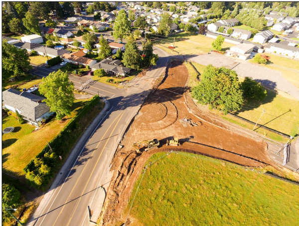
Above: The Keizer roundabout site during construction.

As the federally designated Metropolitan Planning Organization (MPO) for the Salem-Keizer area, the Salem-Keizer Area Transportation Study (SKATS) continues its role in promoting and supporting comprehensive, multi-jurisdictional and multi-modal transportation planning in the Salem-Keizer-Turner area. MWVCOG staff are responsible for the operation of the SKATS MPO.