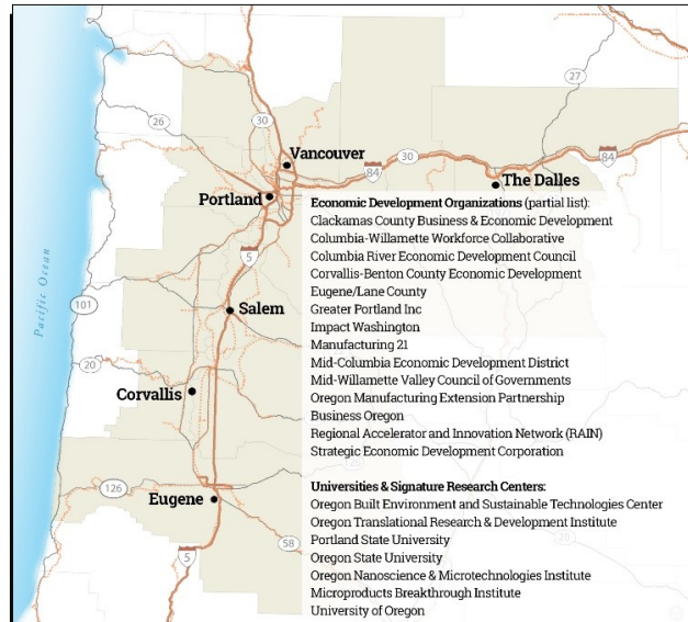
A map of one of the Pacific Northwest Manufacturing Partnership alliance.