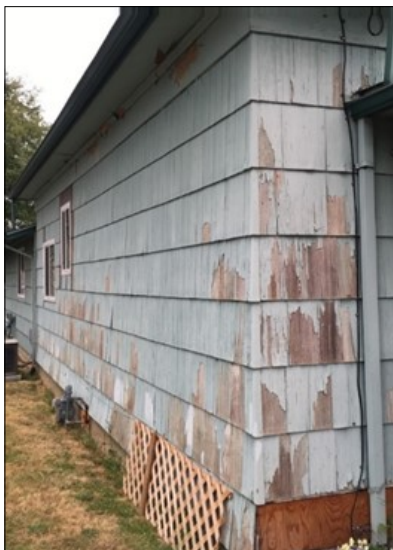
At Left: Original, deteriorated cedar siding and gutters on a home in Aumsville.