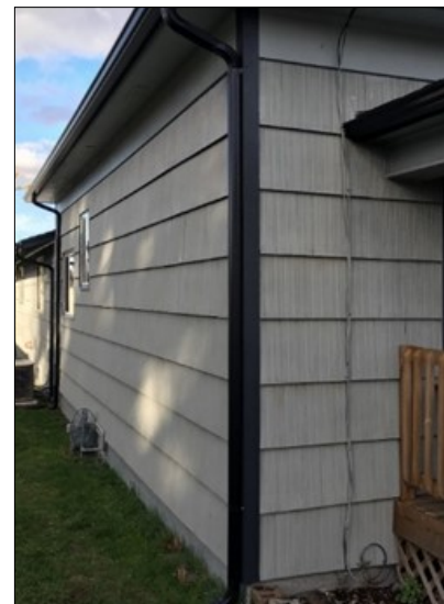
At Right: New cedar siding, gutters and exterior paint on home in Aumsville.